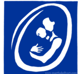
December 22 – O Emmanuel