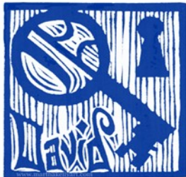
December 8 – O Key of David